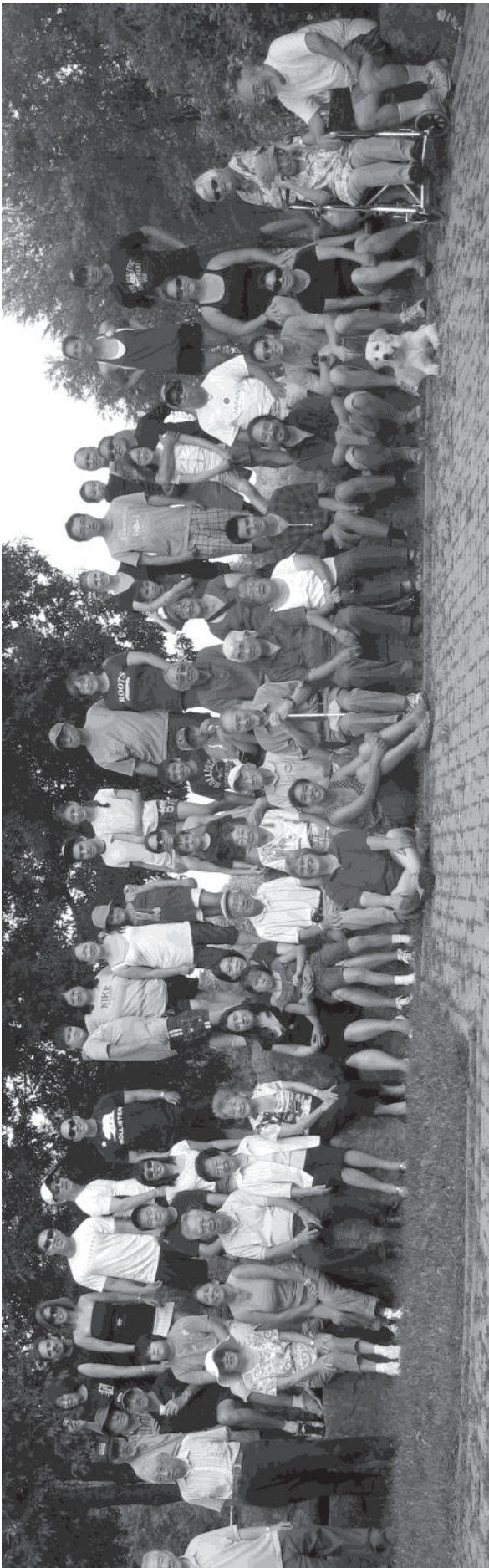
20th Annual Hamilton NAJC/CJCC Community Picnic, August 15, 2010