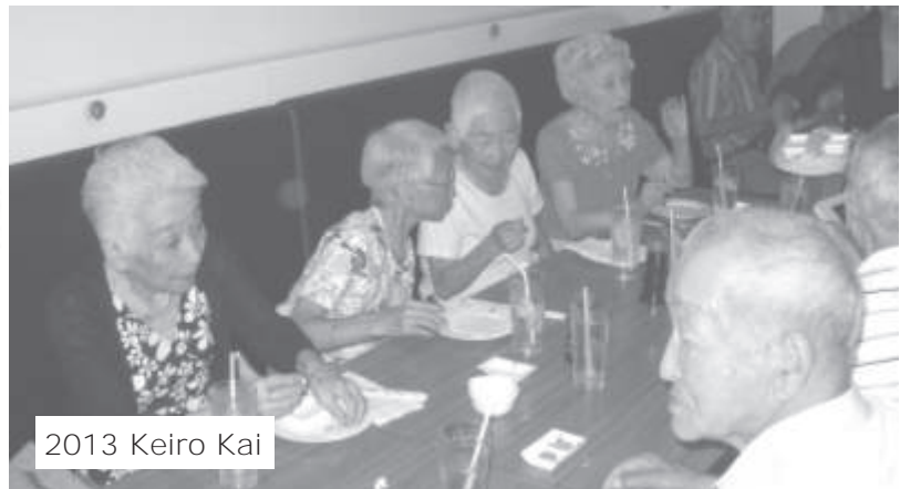
2013 Keiro Kai