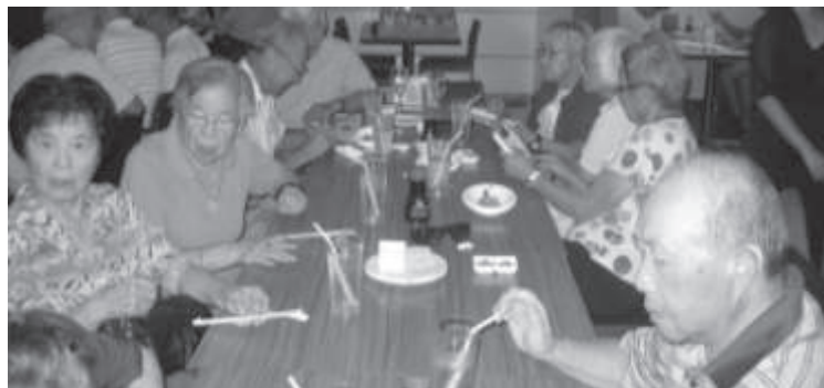
2013 Keiro Kai

Personal and Corporate donations will be gladly accepted. Thanks for your continued support.