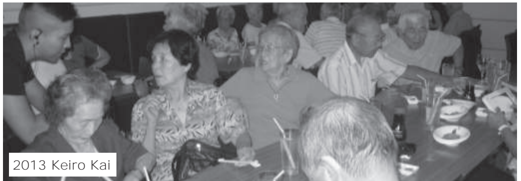
2013 Keiro Kai