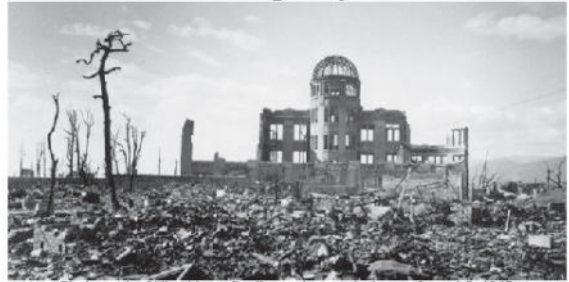
Photograph of Hiroshima after the nuclear explosion on August 6, 1945